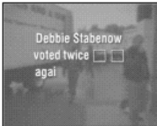
voted twice against getting rid of the Death tax.