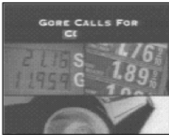
with what he calls a CO2 tax. Gore supported a call to raise taxes