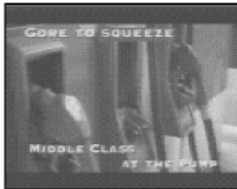
gasoline pump. Gore cast the tie-breaking vote to raise gas taxes