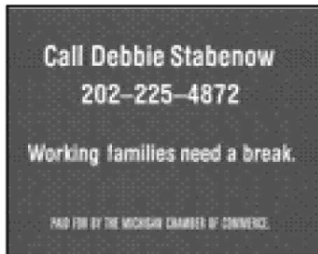
[PFB Michigan Chamber of Commerce]

Campaign Media Analysis Group 703-683-7110 www.politicsonTV.com