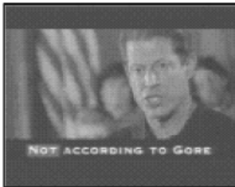
[Announcer]: Are you taxed enough already? Not according to Al Gore. Gore plans to squeeze more money out of middle class families at the