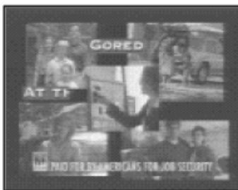
Gored at the pump. [PFB: Americans for Job Security]

Campaign Media Analysis Group 703-683-7110 www.politicsonTV.com