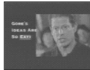
so extreme. If they ever came to pass, Americans would truly be