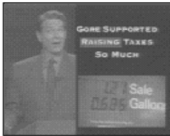
so much that gas would cost $3 a gallon. And Gore's ideas are