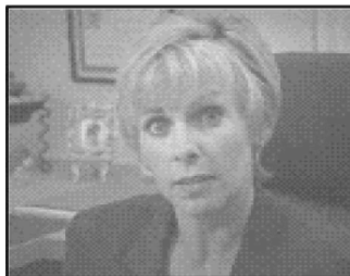
[Announcer]: Call Debbie Stabenow. Tell her our working families need a break.