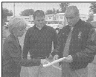
One day we hope to own it but because of the law, we can